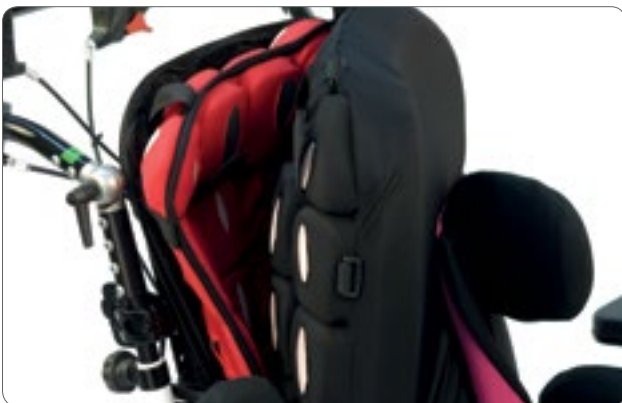
Triple-layered cube contouring cell system provides configurations for a perfect fit and shape for the client.