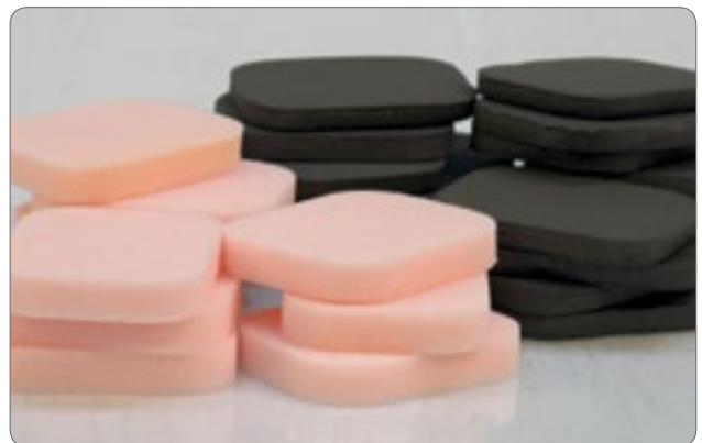
2 densities of contouring pads included in every kit to ensure correct personal fitting.