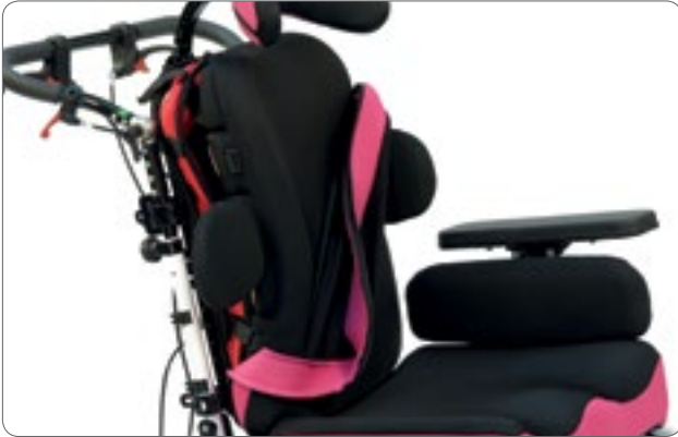
Expansion fabric cover that allows all kinds of contouring without compromising skin protection.